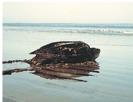
Figure 1 Leatherback turtle ( Dermochelys coriacea ): once abundant in the Pacific, populations have plummeted as a result of capture by fisheries.

How could the Playa Grande turtles have vanished? They could have died; they could still be in the ocean and nesting less frequently; or they could have nested elsewhere. The second explanation is possible but unlikely, as we have determined the mean re-nesting interval to be 3.7 years. Of the 15.4% of leatherbacks that returned to nest in subsequent seasons, 0.5% returned after 1 year, 20.3% returned after 2 years, 46.5% returned after 3 years, 15.5% returned after 4 years, and 17.2% returned